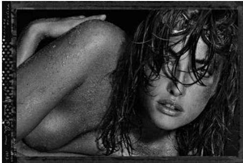
TATIANA PATITZ, NEW YORK, 1987