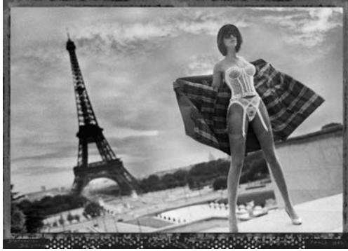
STEPHANIE SEYMOUR, PARIS, 1982