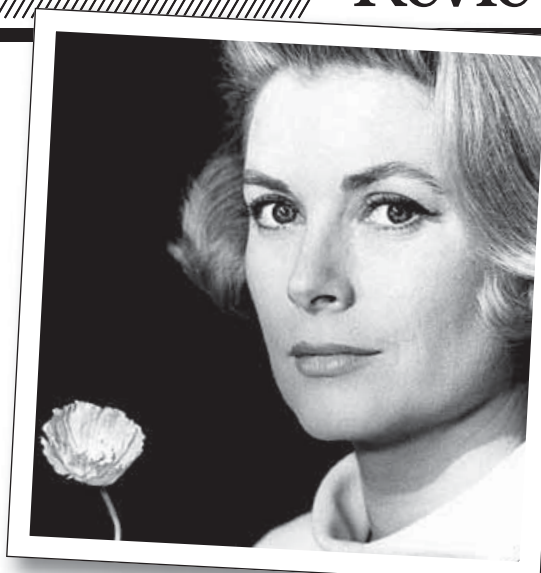
STRIKING INSIGHT: Grace Kelly, pictured by Brynner in 1956