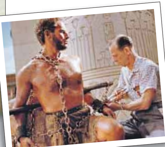
CANDID: Bergman filming Goodbye Again (1961) and Heston in The Ten Commandments (1956)

● Yul Brynner: A Photographic Journey opens at The Little Black Gallery , 13A Park Walk, London SW10 0AJ on Wednesday and runs until February 11 ( thelittleblackgallery.com )